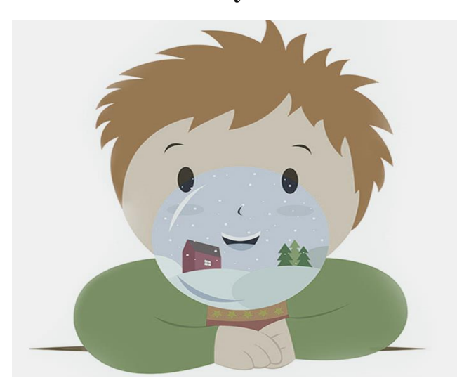
The Crystal Ball

6. Read the following paragraph and answer the given questions. (03 Marks)